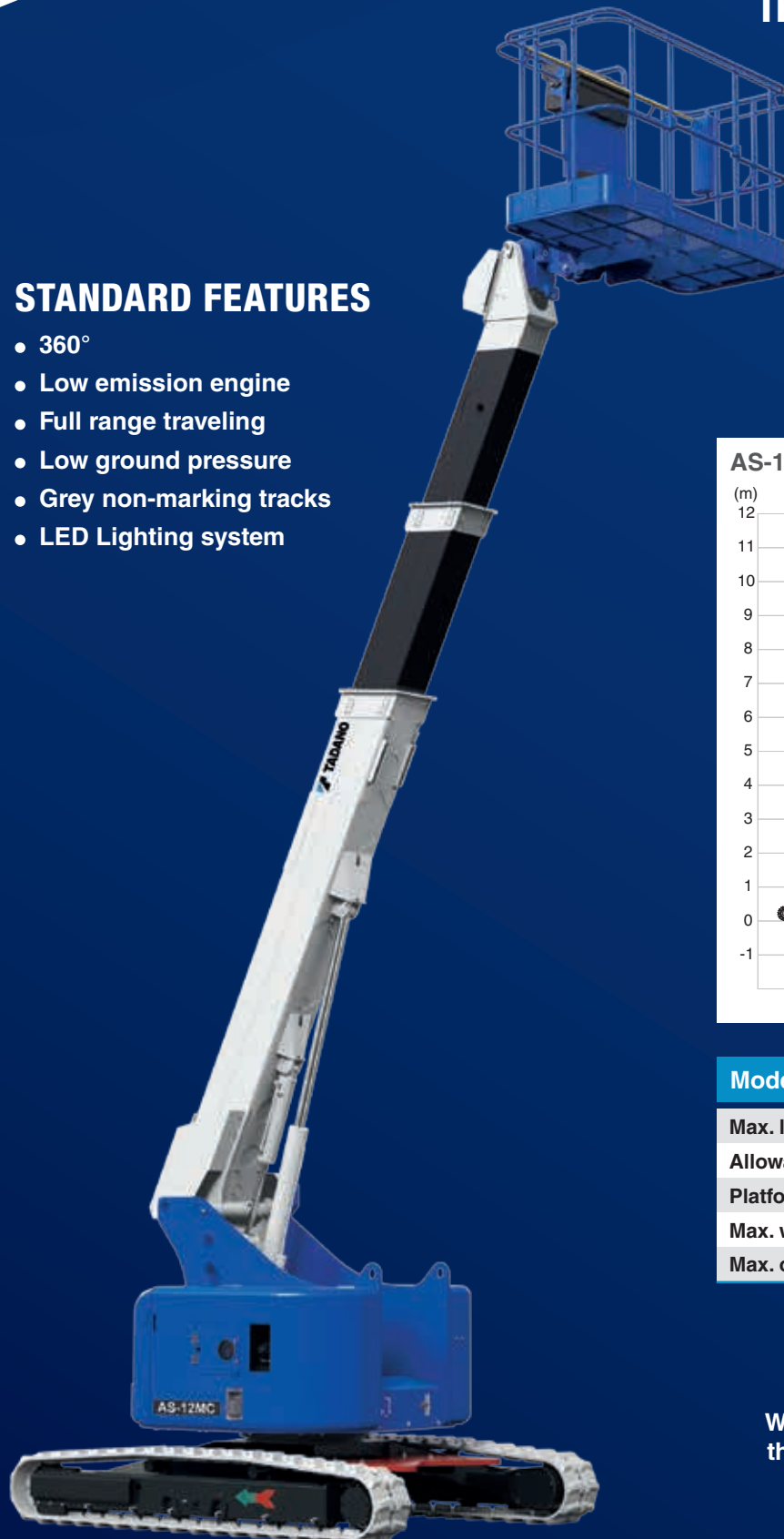
AS-12MC Travel Range