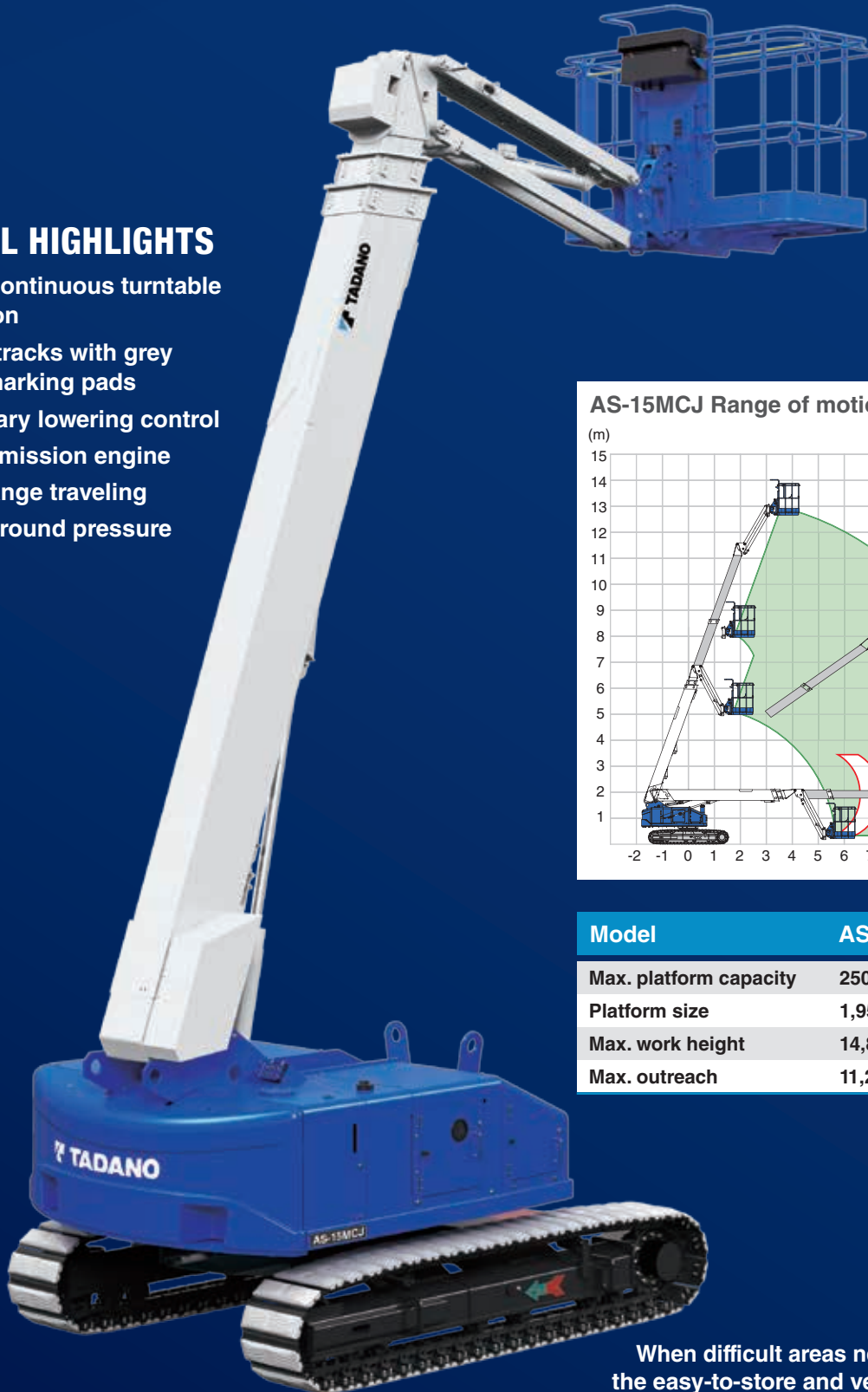
AS-15MCJ Range of motion