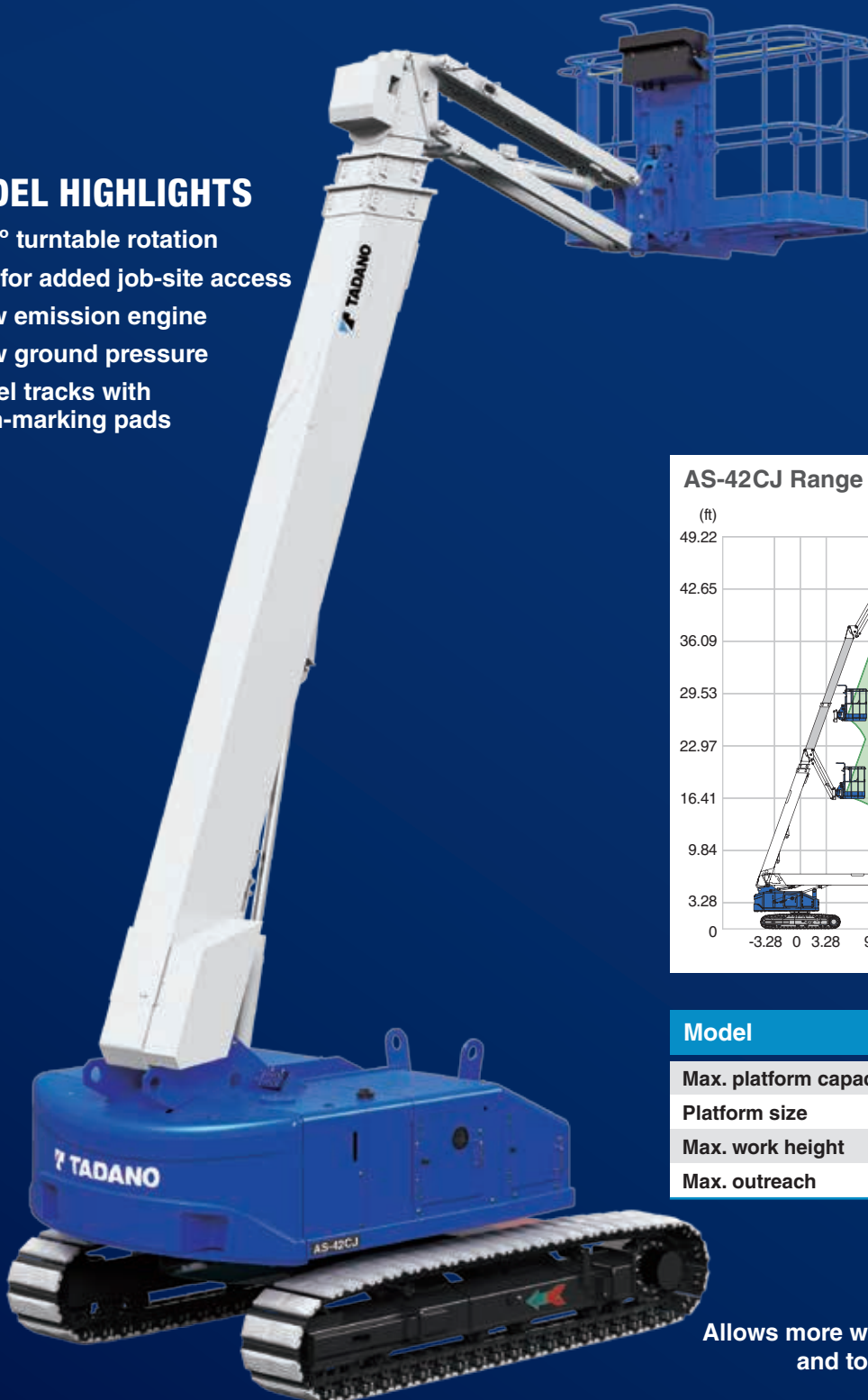
AS-42CJ Range of motion