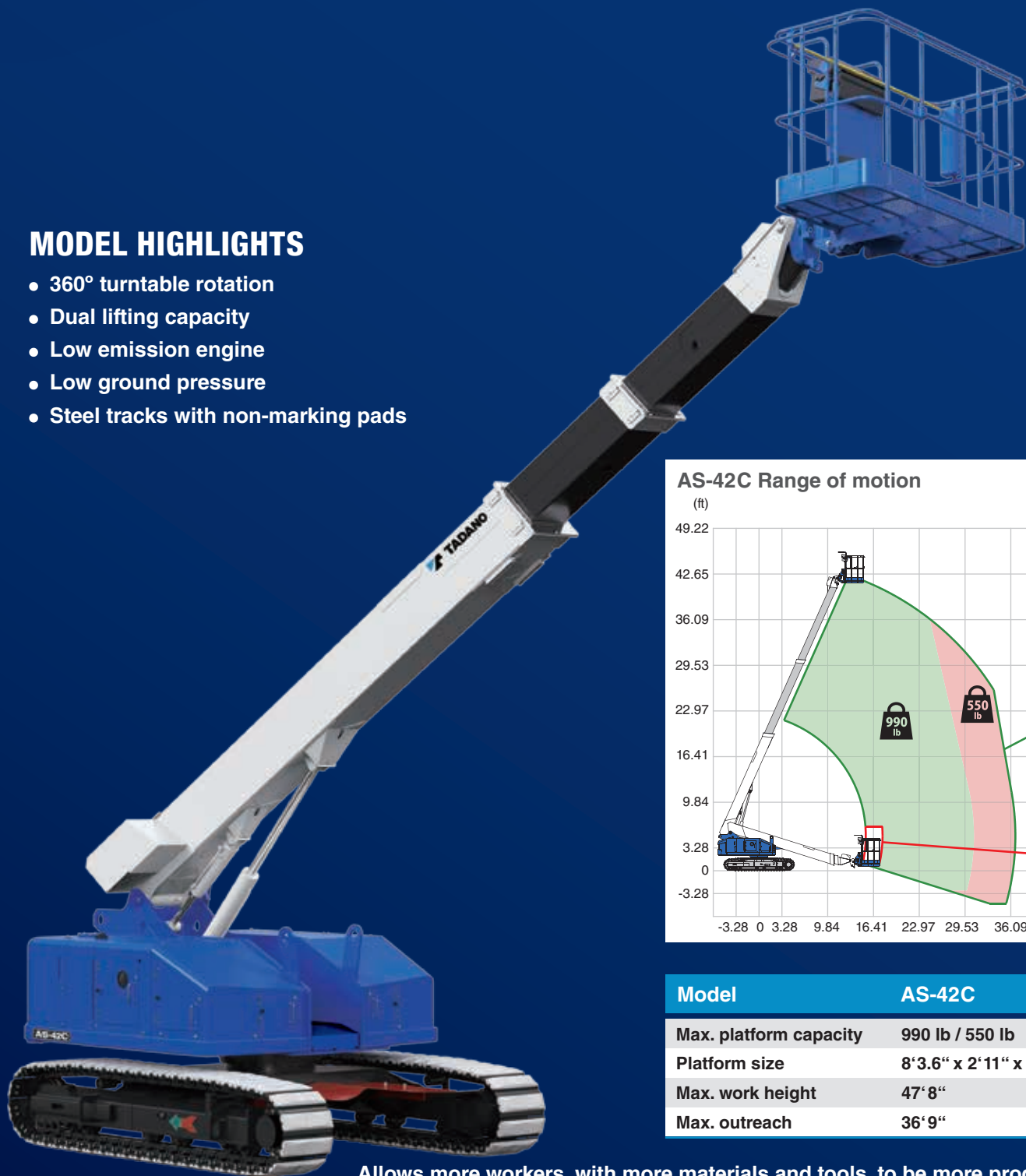
AS-42C Range of motion