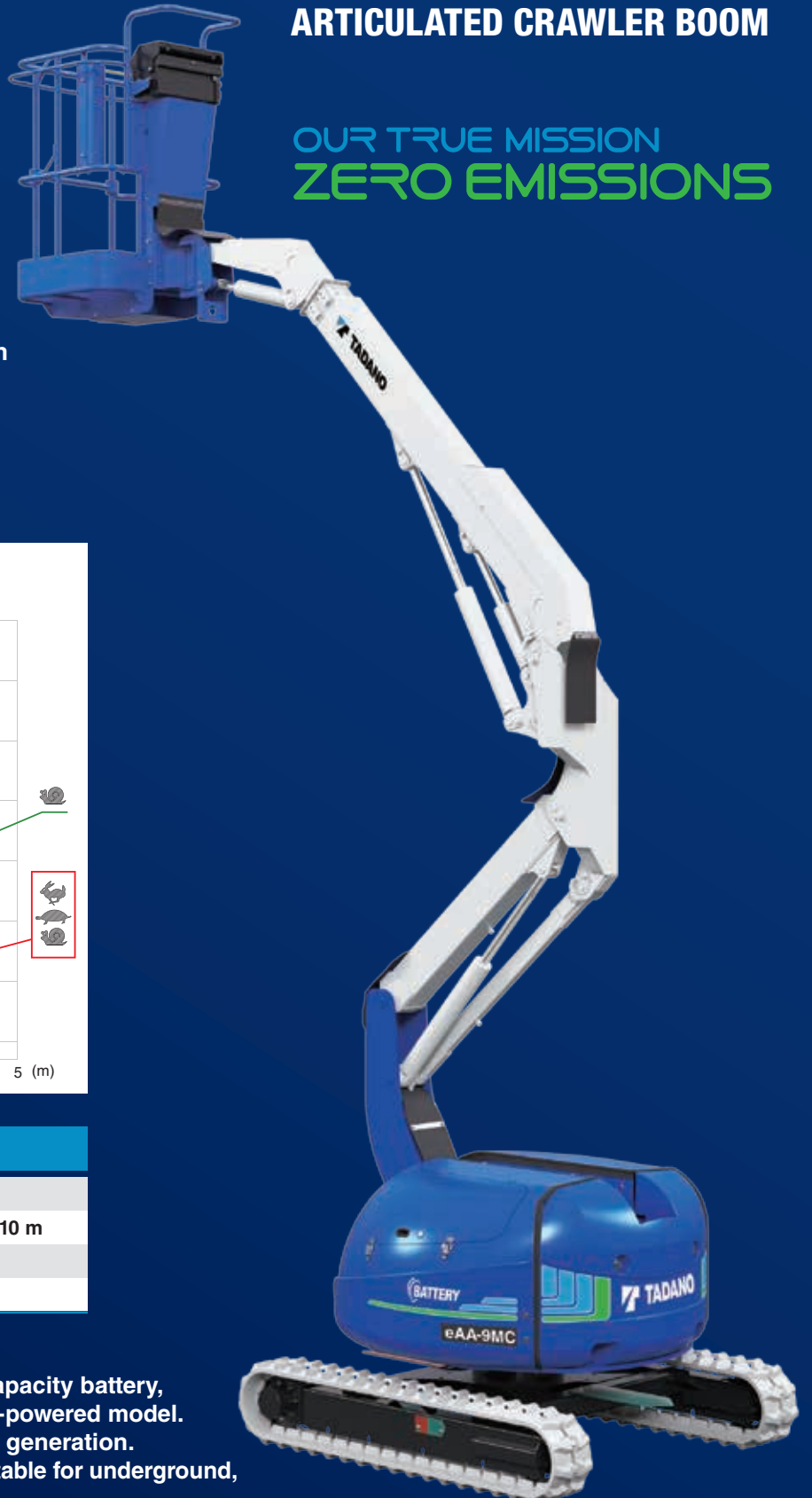
eAA-9MC Range of motion