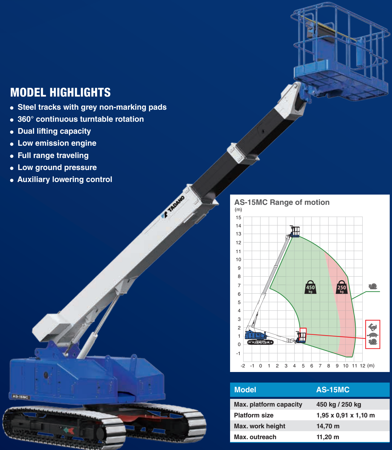
AS-15MC Range of motion