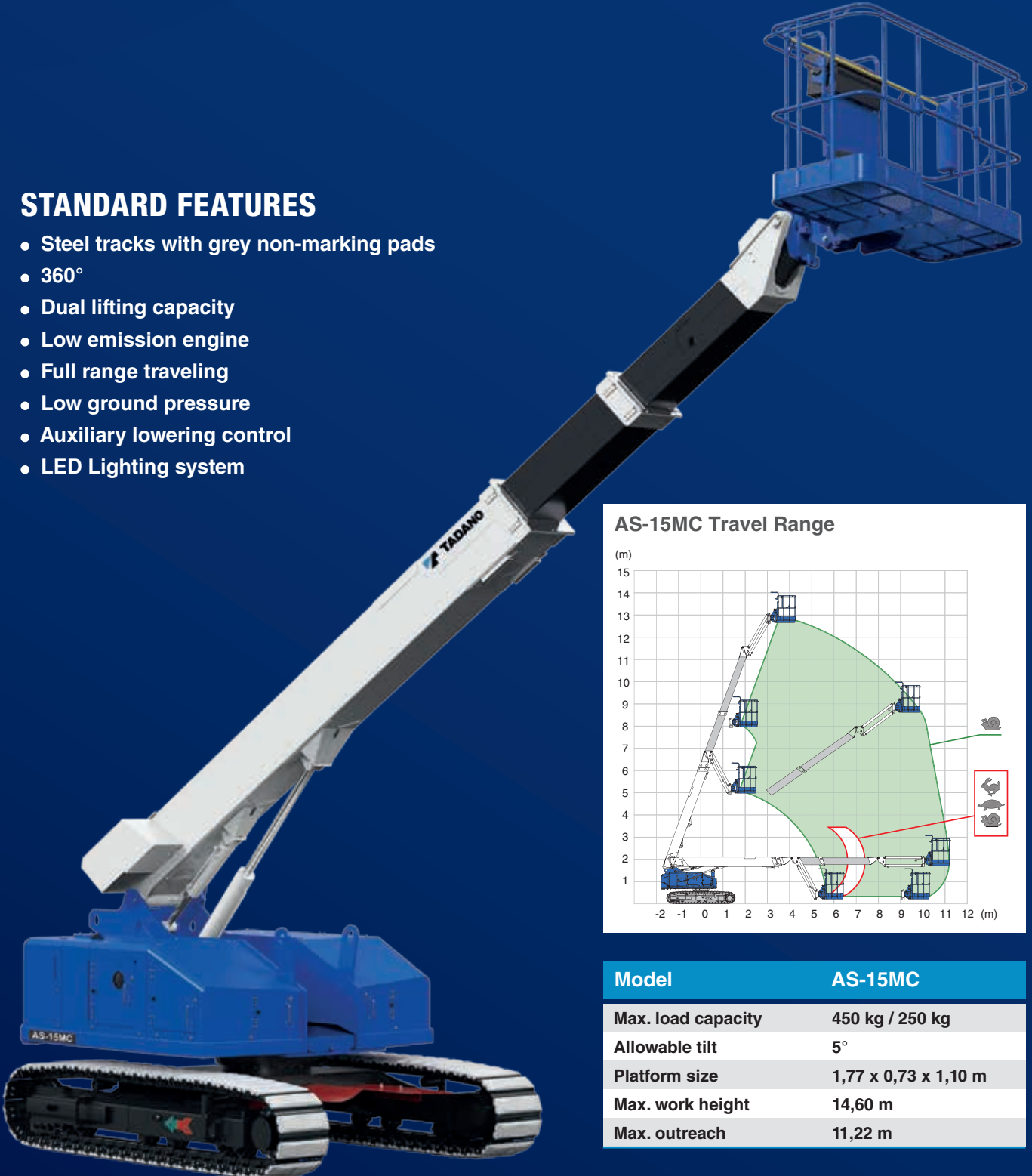
AS-15MC Travel Range