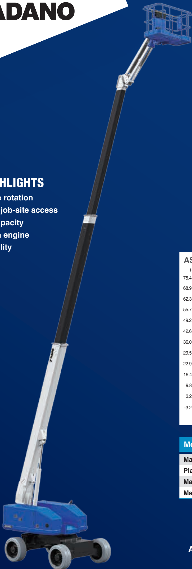
AS-69J Range of motion