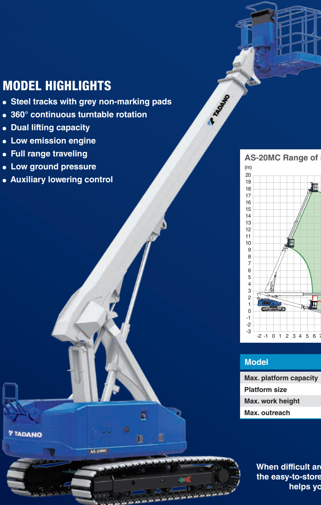
AS-20MC Range of motion