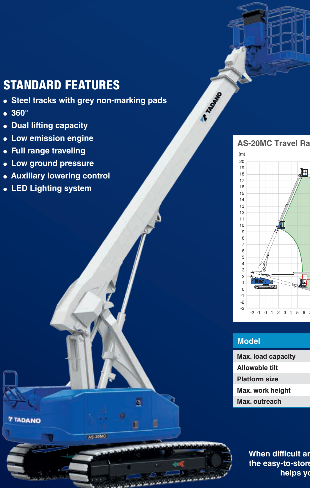
AS-20MC Travel Range